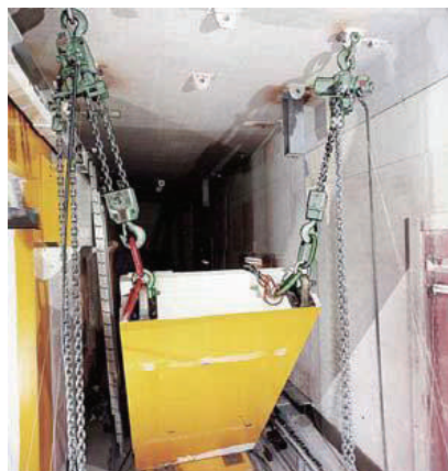
Photo at left shows the mounting of a steel door weighing 33 tons with two JDN Profi 25TI air hoists. Go to http://www.jdneuhaus.com/us/hoists/jdn-air-hoists-profi/examples-of-application.html to see JDN hoists in unlimited applications.

Call 800-331-2889 or email info@jdneuhaus.com with your request for quote or for answers to your material handling questions!