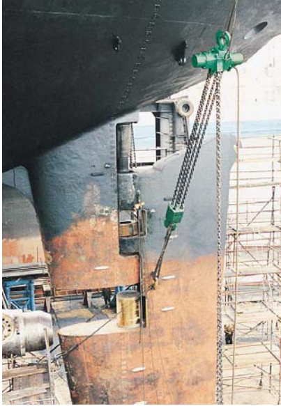
Mounting a rudder blade with two JDN Profi 100 TI Air Hoists