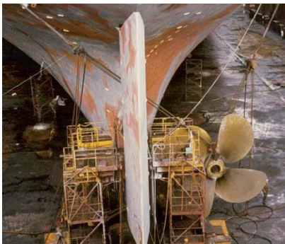
Disassembling a propeller with several JDN Profi 50 TI Air Hoists

Compared with electrical hoists JDN Air Hoists have a wide application range. This is an advantage in shipbuilding whether used for the installation of rudder blades, propellers, drive shafts or for general maintenance work.